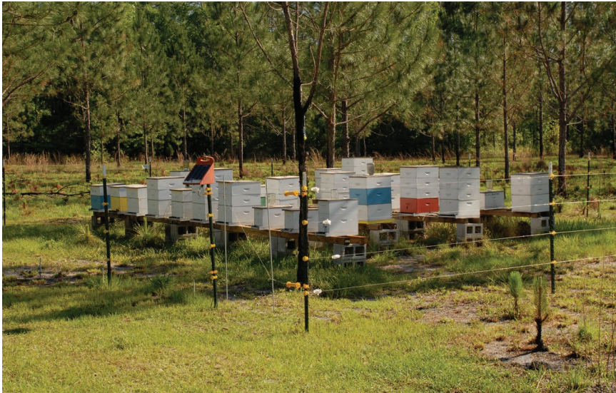
Figure 1: An apiary established for honey production. This apiary is located where bears are present so it was necessary to build a bear fence to protect the bees. Saw palmetto and gallberry are blooming in the pine forests surrounding the apiary, making this a good location for honey production.

• Other management issues are worth considering. How many colonies can an apiary support? Is your production area home to plants that produce prized honeys (sourwood, tupelo, citrus, etc.)? How many colonies are too many for one person to manage when producing honey (that number seems to hover around 700-800 colonies)? Are you in an area where bears live (see figure 1)?