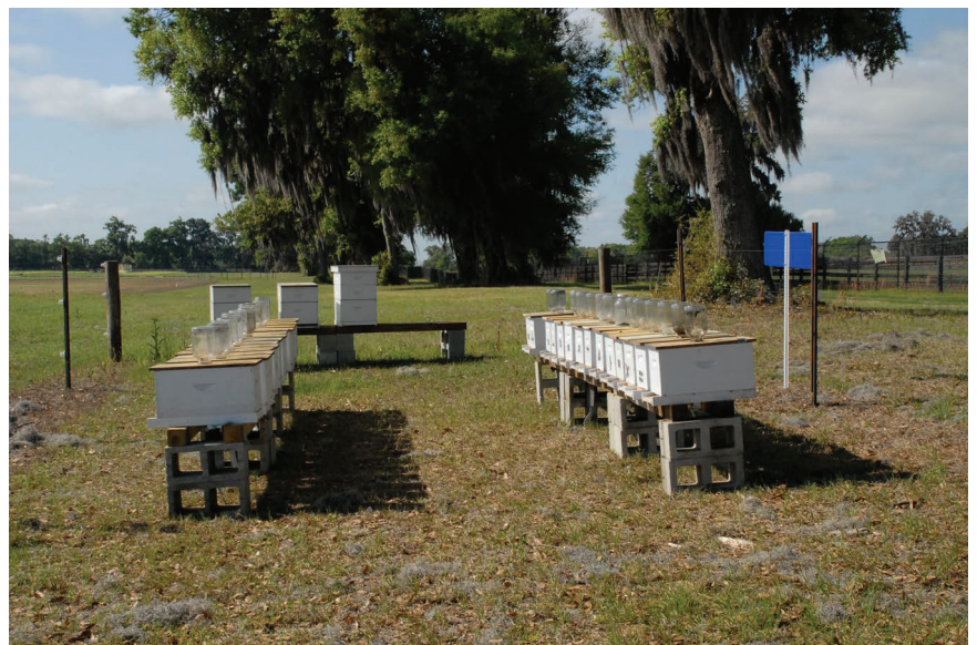
(l) Figure 6: Making splits is hard but rewarding work. These hive bodies are ready to receive frames of honey, pollen, and brood from strong, parent colonies. Photo: University of Florida. (r) Figure 7: An apiary of newly made nucs. These nucs are ready for sale. Photo: University of Florida.