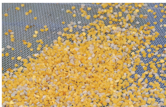
Figure 3: (a) Fitting colonies with pollen traps to collect pollen. The trap goes between the brood chamber and the bottom board. In this photo, the pollen trap is sitting on the bottom board and the brood chamber is being placed on top. (b) Pollen can be collected and sold as an alternative hive product.