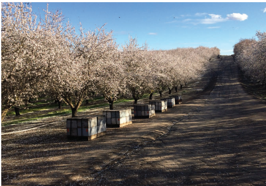
Figure 2: Pallets of bees placed on almonds in California. Almonds have the nation's greatest demand for honey bee pollination services.

• Other management issues are worth considering. How many colonies per acre are needed to pollinate the crop adequately? How far are you willing to travel to pollinate crops? Are you willing to work bees at night, assume the risk of moving them on the highways, and expose your bees to crop protection products?