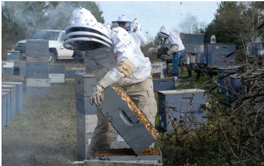
Figure 8: A beekeeper removing a honey super in order to inspect the brood chamber below. Beekeeping is a rewarding endeavor. It is important to know your goals in order to maximize your productivity and your colonies' potential.

ing industry after they have spent some time as a beekeeper. Thus, I felt it was worth discussing here.