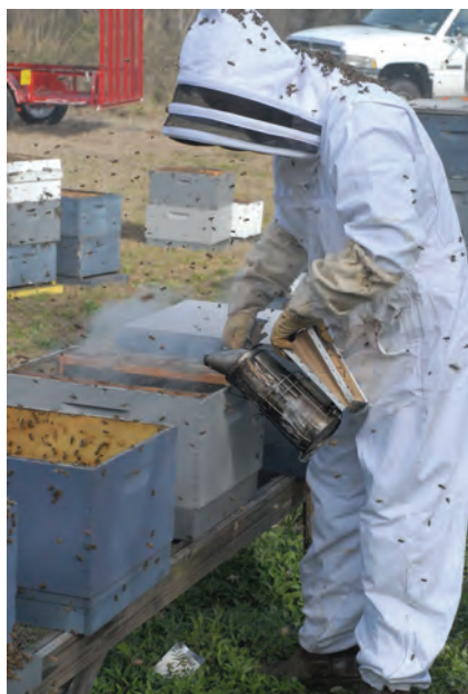
Figure 3 – Bee suit. This bee suit has a pre-attached veil.

$189.95. The cheaper options would replace your need to purchase helmet, veil, and suit separately. Furthermore, it would lower your overall budget for personal protective equipment. However, the most expensive combos cost more than the best suits, helmets, and veils purchased separately. Yet, they also tend to be a lot better quality than the items that are offered separately.