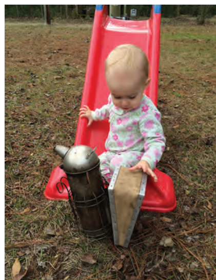
Figure 4 – Every beekeeper needs a smoker. This particular smoker has a grill that surrounds the smoker's body. The grill helps protect the beekeeper from burns.

Deep Hive Body – For purposes of simplicity, I assumed a common hive configuration where one deep hive body is used as the brood chamber. Deep hive bodies typically come in multiple grade qualities, from budget (the cheapest) to select (the most expensive).