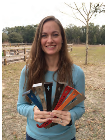
Figure 5 – Hive tools come in all shapes, sizes, colors, and prices.

Smoker – Smokers (Figure 4) come in a few sizes. I recommend purchasing the largest smoker you can afford. Many smokers