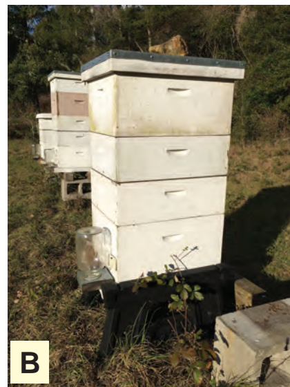
Figure 7 – Hive stands. (A) A hive stand composed of 4 cement blocks – two stacks of two blocks/stack – on which two, six foot, treated 4 × 4's rest. This is a budget hive stand. (B) The Ultimate Hive Stand represents a newer style of stand, one that was designed specifically as a hive stand and which comes with various features.

Sheets of Deep, Plastic, Beeswax-Coated Foundation – Foundation must be installed in the frames. There is a wide range of foundation types. The prices in the table represent the low and high costs associated with purchasing plastic foundation having a thin beeswax coating. Using any other foundation type could alter the overall costs of acquiring foundation.