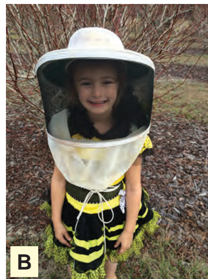
Figure 1 – Two styles of bee veils: (A) a square veil with a plastic helmet and (B) a hat/veil combo.

cost is assigned to select or higher quality equipment. In general, the items were priced similarly across the three equipment supply companies.