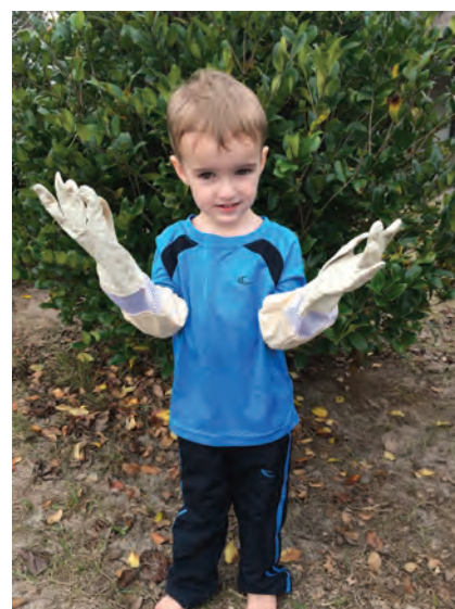
Figure 2 – Bee gloves come in all sizes, from children to adult. They also are made to various qualities.

Bee Suit – Bee suits (Figure 3) also come in a diverse range of sizes, styles, and quality. The cost of a suit is pretty reasonable. It is worth noting that the best quality suits usually come as suit/hat/veil combos and I did not include prices for those costs in the table. I note that the costs for suit/hat/veil combos ranges between $69.95 and