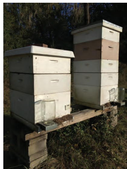
Figure 8 – Hive feeder. Nearly all hives need to be fed at some point. It is best to have a feeder ready the moment you start keeping bees. Both hives in this picture have an entrance feeder installed.

3 lb Package of Bees with Queen – There are multiple ways to acquire bees and queens and I only focus on the costs associated with purchasing a package of bees as noted in Table 1. To generate the cost range for packages presented in the table, I conducted internet searches of 5+ companies across the U.S. that sell package bees and I report the range of 2015 prices that I found. The 3 lb package with a queen is the most common package size and type, though one can purchase 2 and 4 lb packages as well as queenless packages. Beginning beekeepers can acquire bees and queens in other ways and this would affect the overall costs associated with starting in beekeeping. For more information on acquiring bees and queens, see: