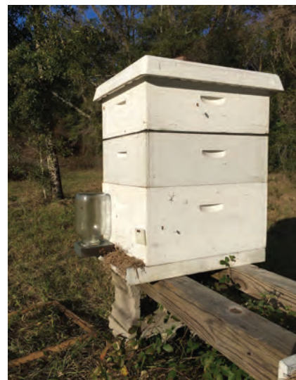
Figure 6 – The “complete” hive described in Table 1. There are many hive styles and configurations. In this article, I describe a hive composed of a bottom board (screened in the case of the hive in the photograph), deep brood box, queen excluder, two medium supers, an inner cover, and a telescoping outer cover. Look closely and you will notice the queen excluder is above the lowermost medium super. I moved it up to allow the bees and queen to cluster in the honey super during the winter months. Normally, I place the excluder between the deep brood box and lowermost medium super.

Deep Frames – I assumed the beekeeper would use 10 deep frames per hive body. Many beekeepers find it more economical to purchase frames already assembled. The prices for frames listed in the table are for unassembled frames.